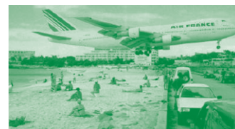
This "photo" is from a Federal Aviation Administration instructional "Noise Course" slideshow, and was intended to be humorous. Airport neighbors aren't laughing.

Our local airport is a Special District (Enterprise District) in California. As such 5 elected directors govern this airport. Five years ago we ran a campaign to get 3 non-pilots who were sympathetic to the noise problem elected. Our best candidate came in 4th and 3 pilots were elected. Four years later the noise problem had become much worse and we ran another